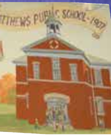
MATTHEWS PUBLIC SCHOOL - 1907