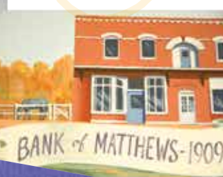
BANK of MATTHEWS-1909