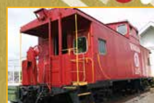
Caboose at the Matthews Train Depot