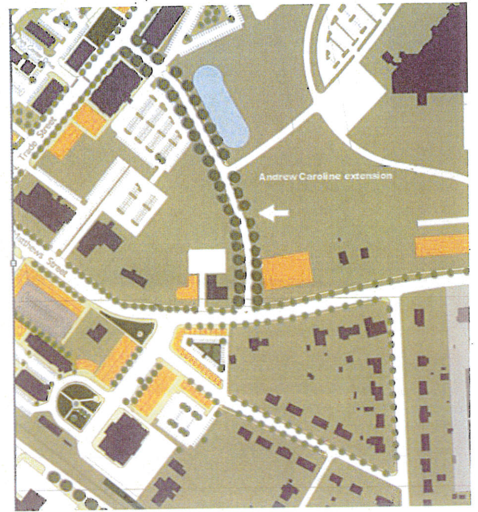
Andrew Caroline Drive Alignment as proposed in Motion 2018-A